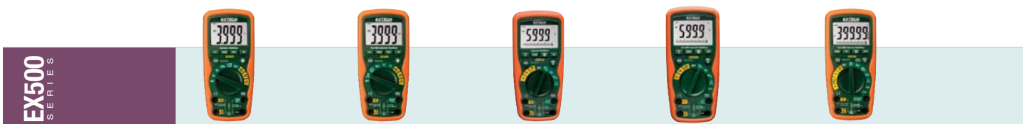
Drop-proof to 6 feet (2.9m)